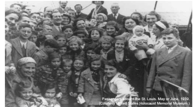
Passengers aboard the St. Louis, May or June, 1939.

Many Canadians showed their displeasure by speaking out, holding rallies, and writing into newspapers.