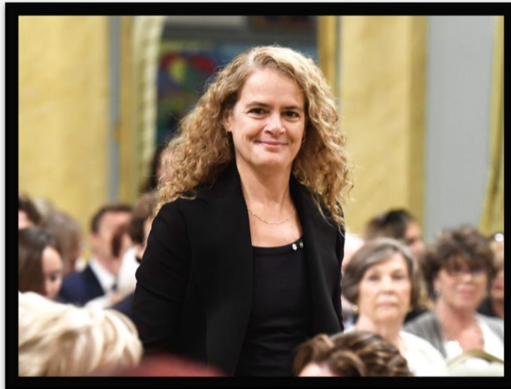
Port Coquitlam's Current Member of Parliament

She has a background as an astronaut, engineer, scientific broadcaster and corporate director.