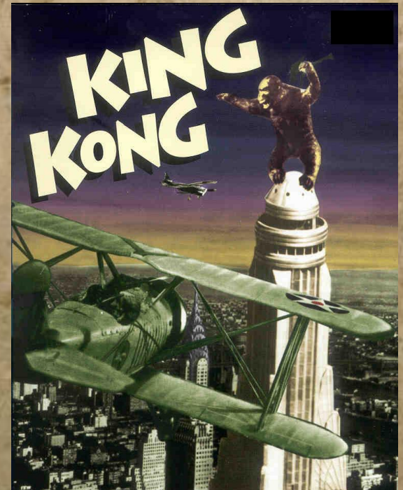
1933: King Kong