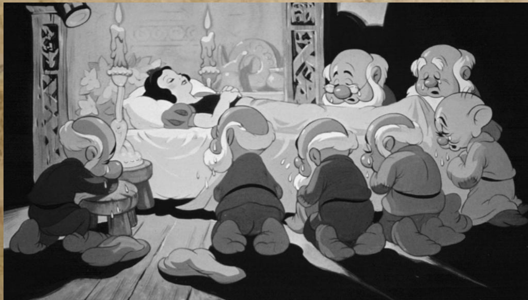
Snow White & the Seven Dwarfs (1938)