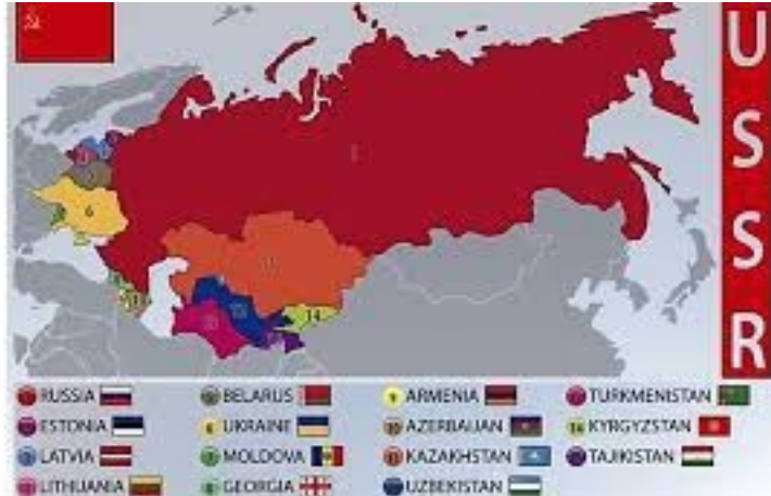
IMG_2968.JPG 23.9 KB