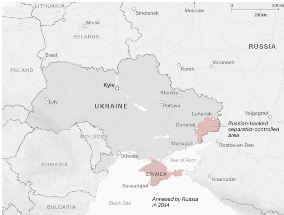
IMG_2966.PNG 533 KB